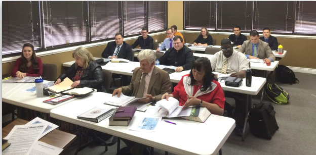
Classrooms are filling up again at the seminary!